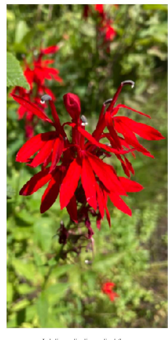
Lobelia cardinalis, cardinal flower