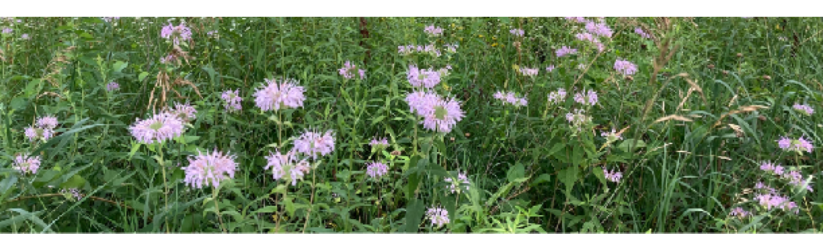
Monarda fistulosa, bee balm

5 gallon: We are mostly using fabric pots from RootMaker but also a variety of re-used pots. Please inquire if you need more specifics.